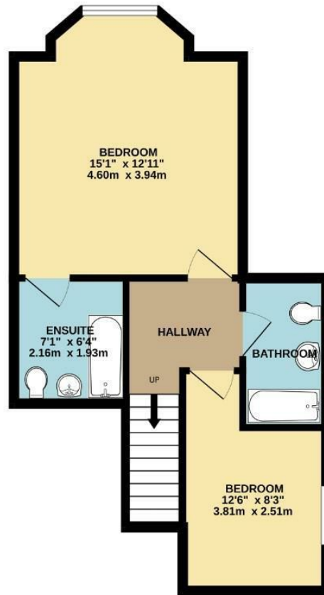
BASEMENT 412 sq.ft. (38.3 sq.m.) approx.